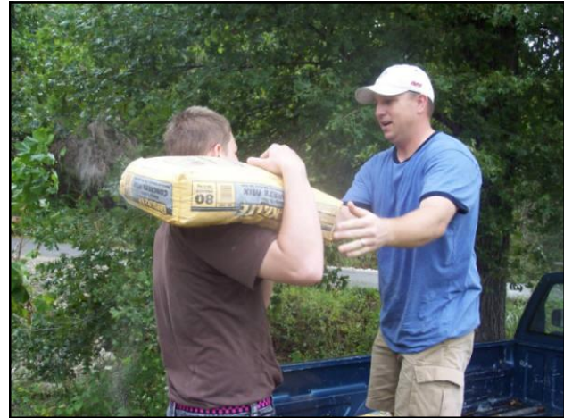
A employee with Chase Card Services and a resident of the Good Samaritan Boys Ranch work on an outdoor classroom as part of a volunteer day held at the Ranch in September.

The group worked four hours and then enjoyed a BBQ lunch together. The volunteers are a great example to the boys at the Good Samaritan Boys Ranch who learned the value of giving back to the community. If your business, church