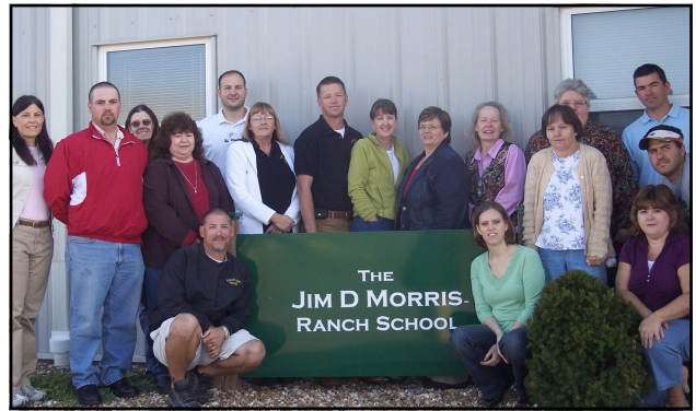
The staff of Pleasant Hope R-VI Ranch School who provide an education to the 76 boys.

The students range in age from 12 . 18 and are in grade levels from 5 . 12. The students